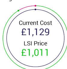
High Street Store